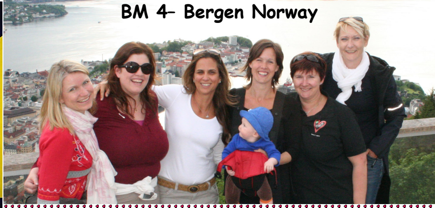
BM 4- Bergen Norway